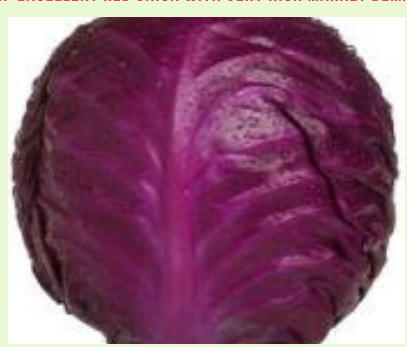
KIFARII F 1

A HYBRID FRESH MARKET CABBAGE WITH EXCELLENT HEAT TOLERANCE.