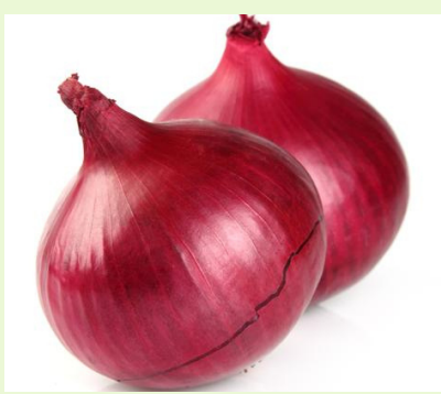
RED KING F1

AN EXCELLENT DETERMINATE TOMATO WITH PERFECT OVAL SHAPE - WILT TOLERANT VARIETY.