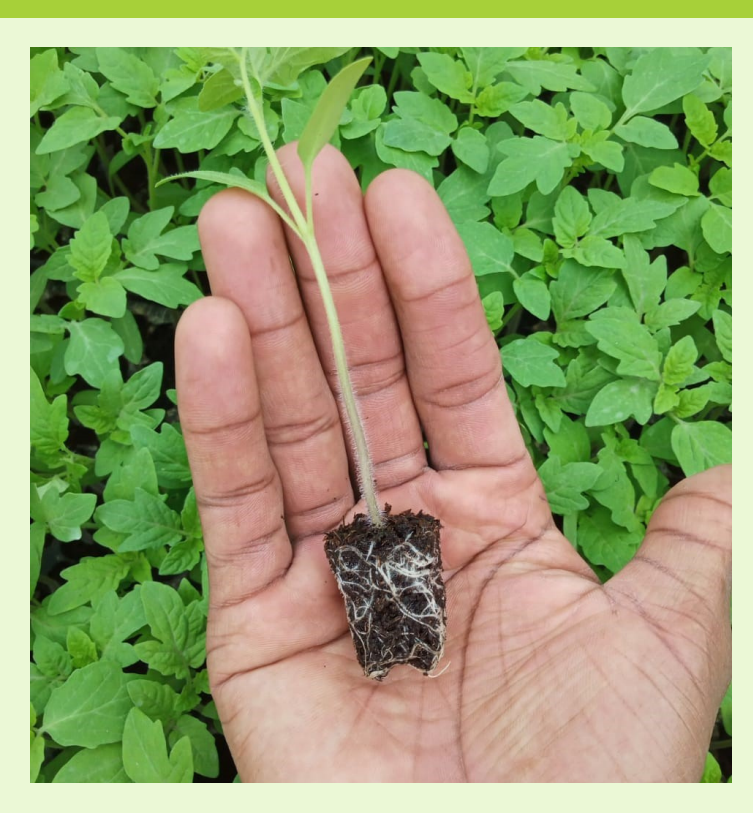
Rocky F1, the perfect way to Rock your tomato farm.!!

Available packaging;(Grams & Seed counts) 5g| 10g| 25g| 50g 100sds| 500sds| 1000sds| 2500sds| 5000sds| 10,000sds