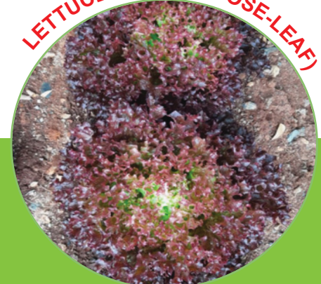
LETTUCE TUSKA (LOOSE-LEAF)