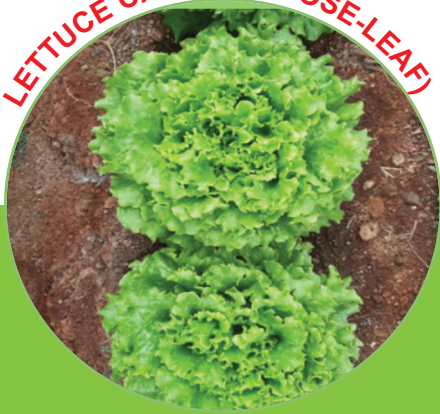
LETTUCE CAIPIRA (LOOSE-LEAF)

Royal Seed has recently unveiled four exciting new lettuce varieties, each tailored to meet specific growing conditions and market needs. These varieties promise to deliver exceptional quality and performance, making them a valuable addition to any grower's portfolio.