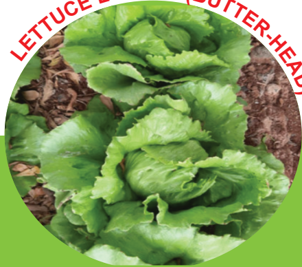
LETTUCE LOBELA (BUTTER-HEAD)