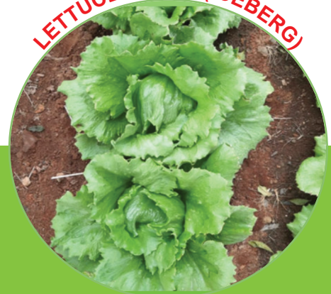
LETTUCE SAULA (ICEBERG)