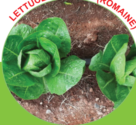
LETTUCE CORBANA (ROMAINE)